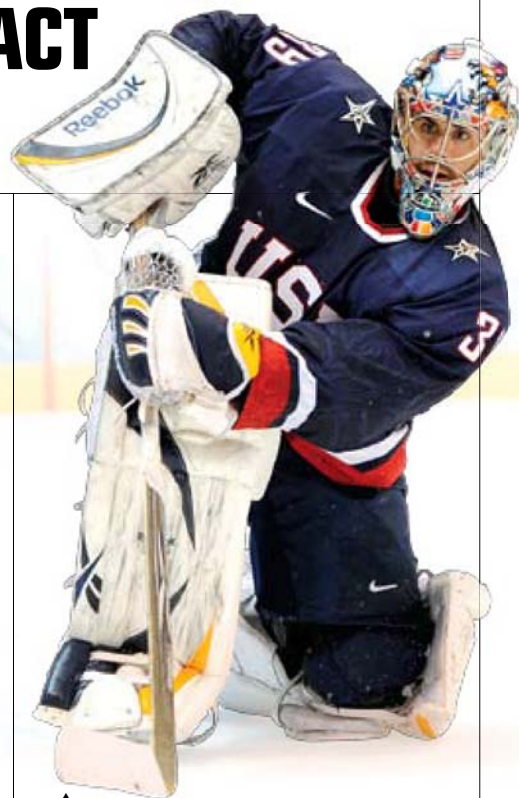
RYAN MILLER captured the Hobey Baker Memorial Award in 2000 as college hockey's most outstanding player with Michigan State.